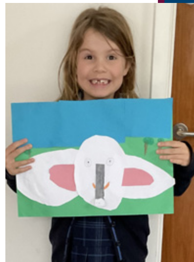
Zara has completed an Art Beacon on an elephant.